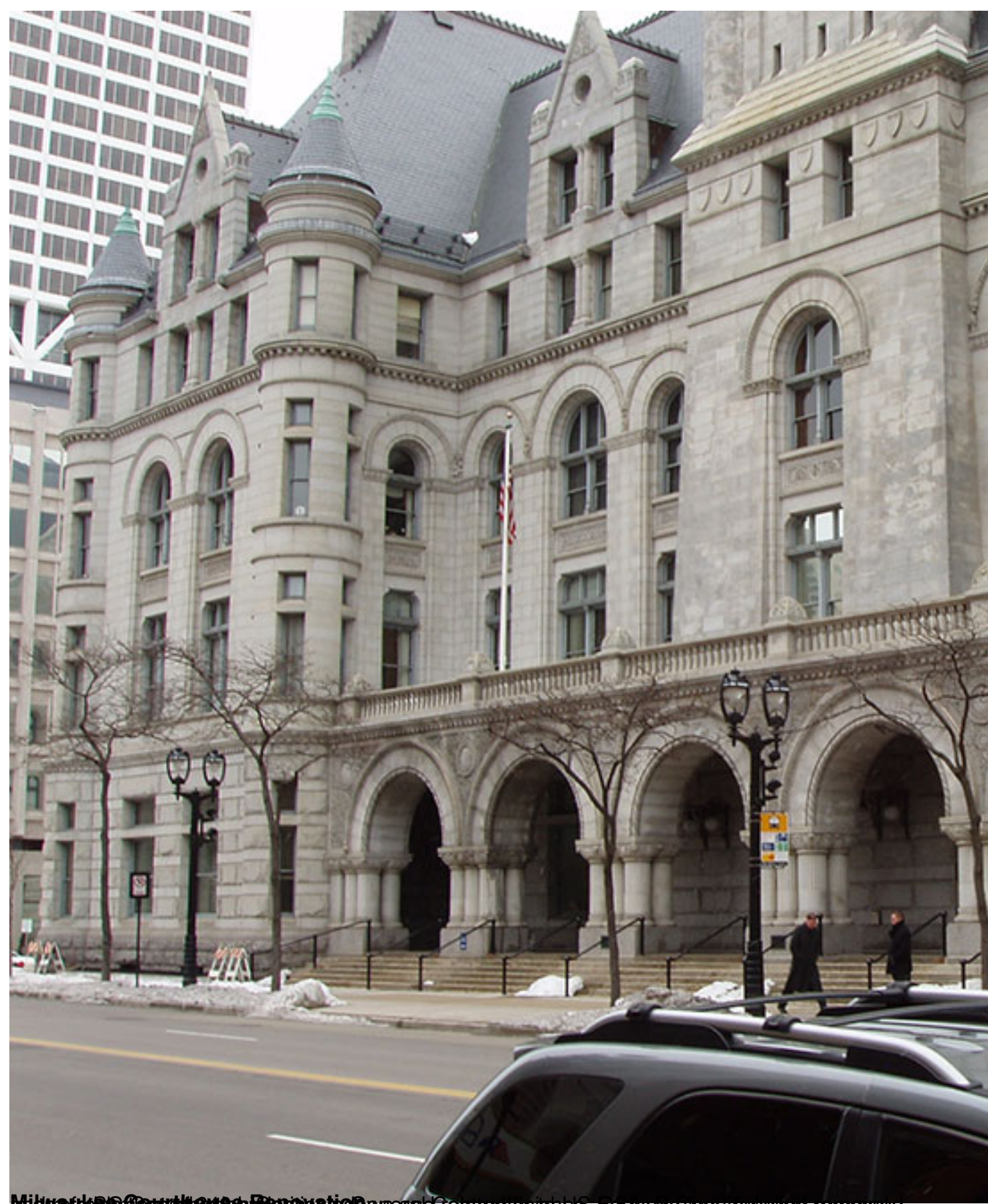
Michaela Countificate projective in clause and Ceratectonishes cover an openim number remanated