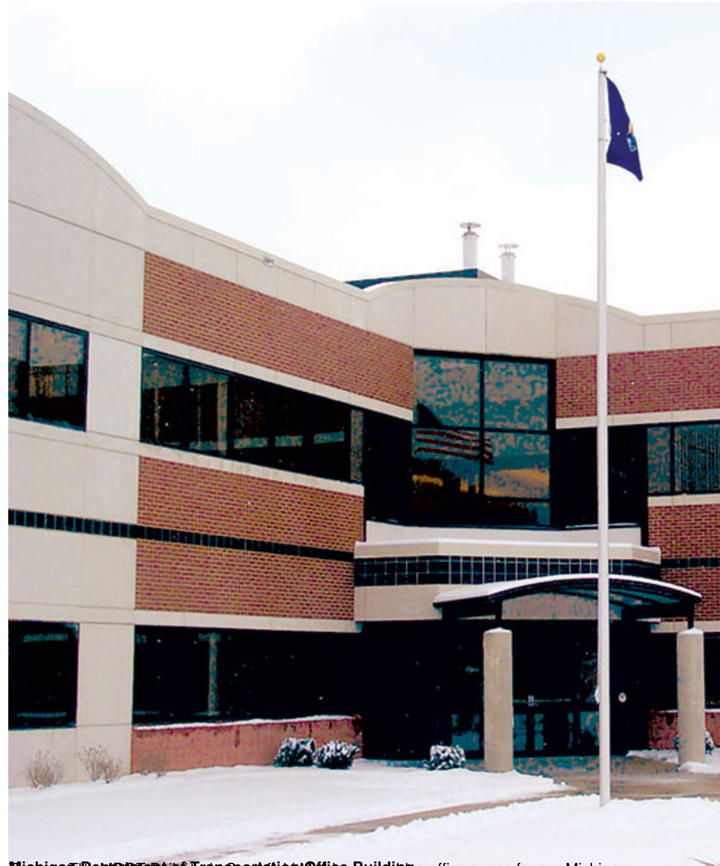
Michiganathe participal transportation Militiga Buildings office space for our Michigan