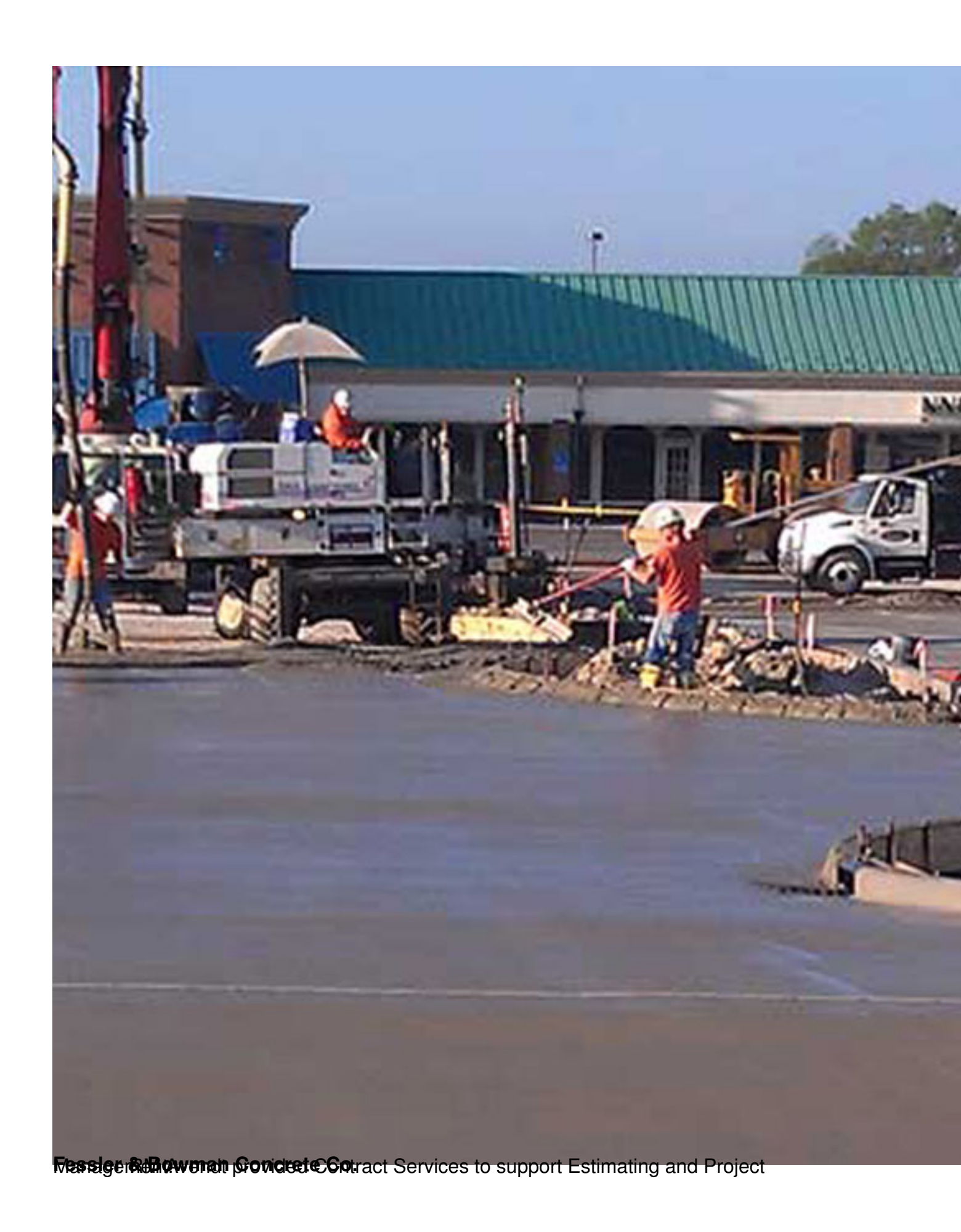
8 / 15