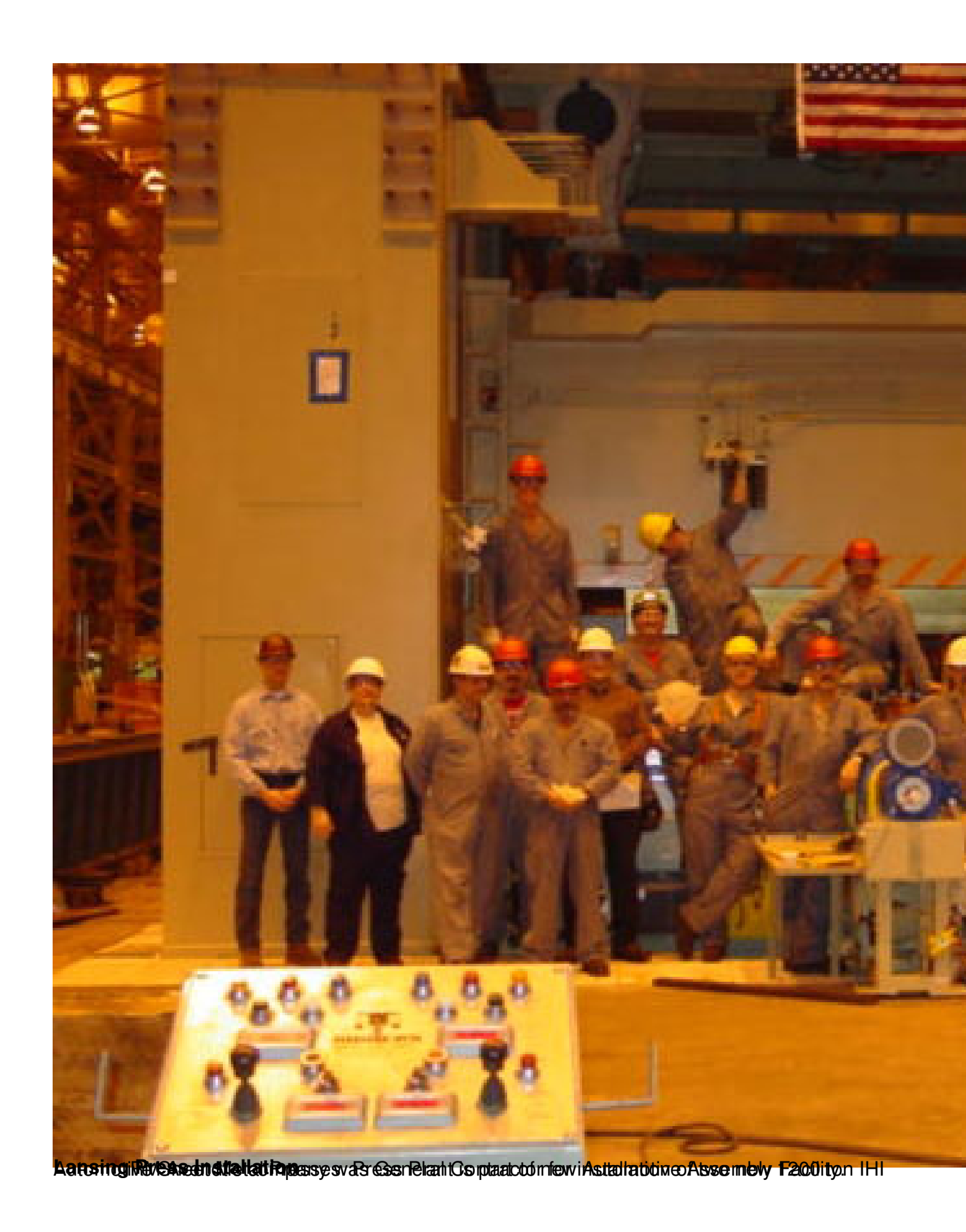
15 / 15